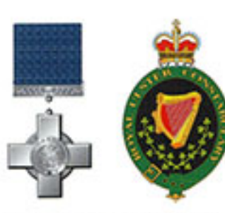
RUC George Cross Foundation